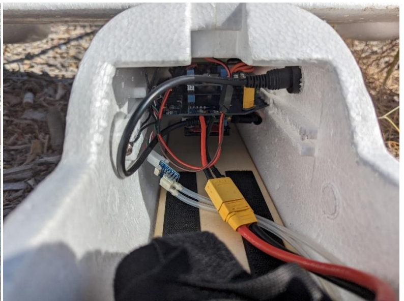
Image shows UxV/35 Components inside aircraft