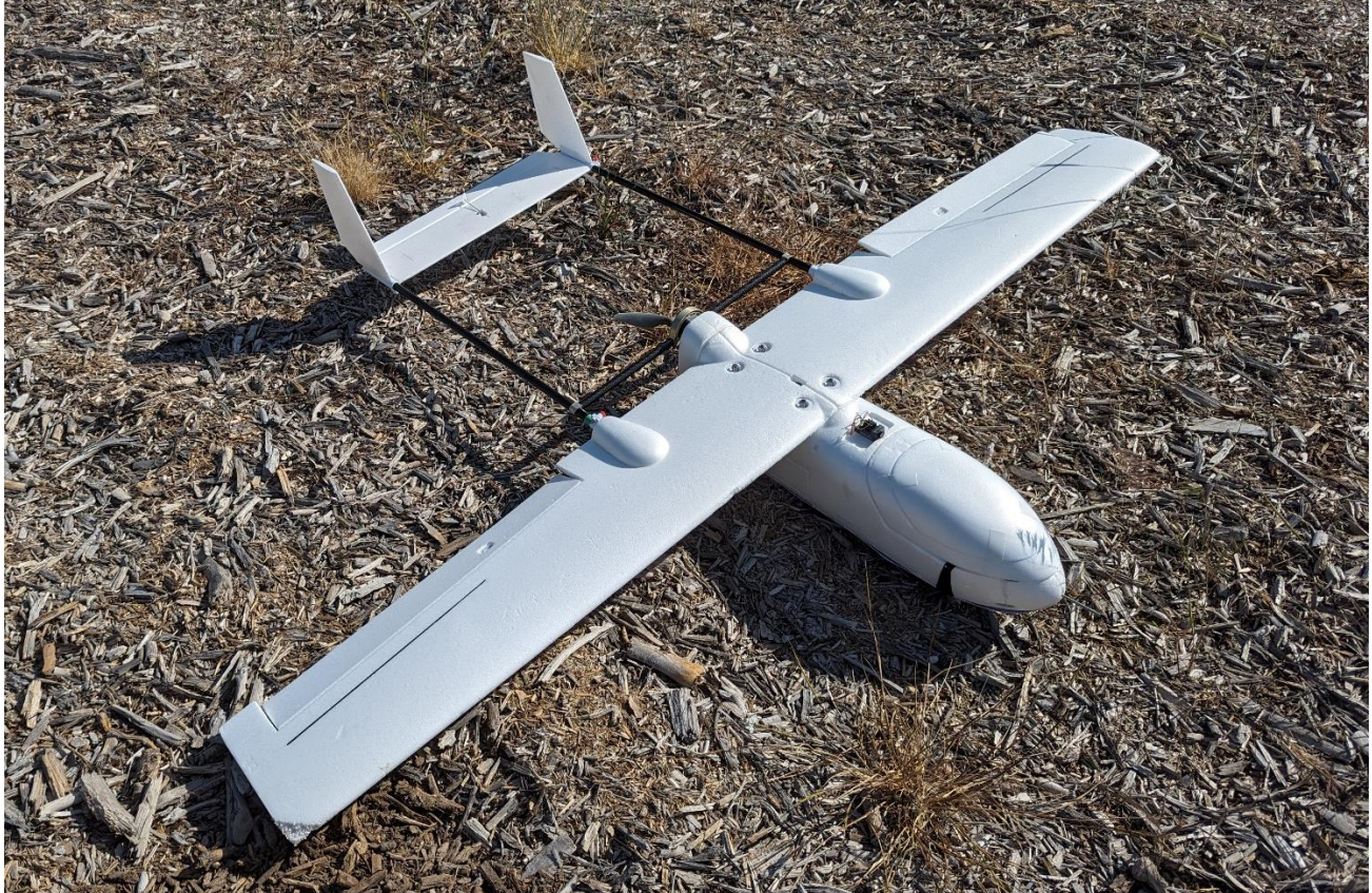
Successful UxV35-Plane Post Landing