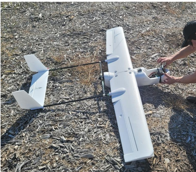
Successful UxV/35 Plane Post Landing