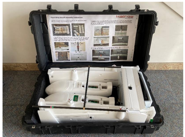
Figure 2: Pelican Protector 1780 Case used for transport (Left). Fully packed system (Right)