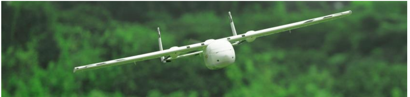
Figure 1: The FWA in flight.

The Fixed Wing Aircraft (FWA) is a new unmanned aircraft system (UAS) from Kairos Autonomi. It is based on a commercially available EPO foam airframe to allow for low costs and rapid development. The fixed wing design gives the aircraft much longer flight times and range than a multirotor UAS platform of